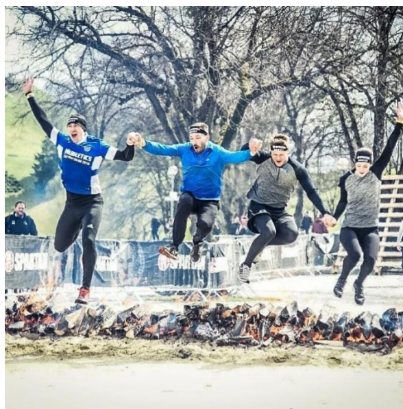
Together through the Firewall

In August 2022, the IPA German Section will compete with a team in the Xletix Challenge, a tough mud and obstacle race near Stadtoldendorf in Germany: https://de.xletix.com .