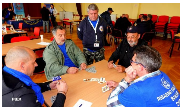
IPA members enjoying the Triathlon activities

In addition, they consumed wine and a special sparkling wine called "Bakarska vodica" – Bakar's water – made from grapes produced by farmers on the rocky slope of the Bakar Bay.