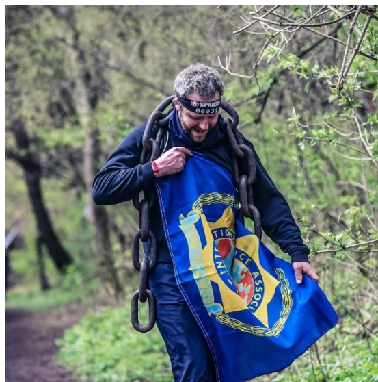
Walking with chains

With the first IPA team member finishing after 1:15 hours, and the last one after 1:54 hours, our IPA competitors celebrated their achievement with a hearty meal and Bavarian beer.